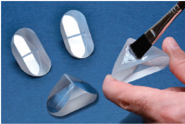
Master Bond LED401 cures quickly and tack free under safe, low-cost LED light sources.

Light cure adhesives already have a compelling value proposition thanks to their easy application and fast cure. Our latest technology breakthrough makes these adhesives even more valuable by enabling a cure to take place under a visible light wavelength of 405 nanometers (nm).